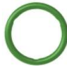
Fig. 2 Viton O-Ring (green)