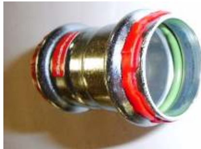
Fig. 1 Fitting before installation