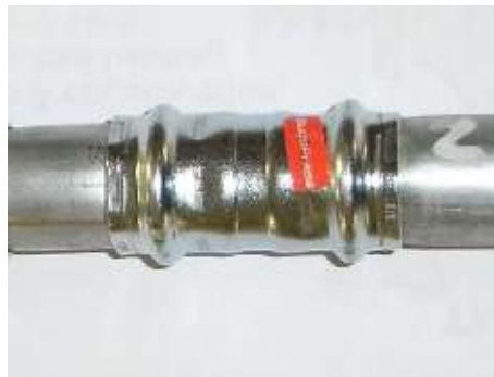
Fig. 3 Pressed Fitting